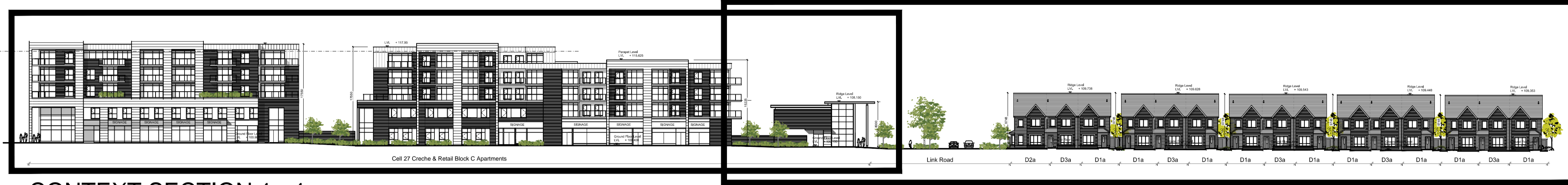
CONTEXT SECTION 1 - 1, Scale 1:500@A1