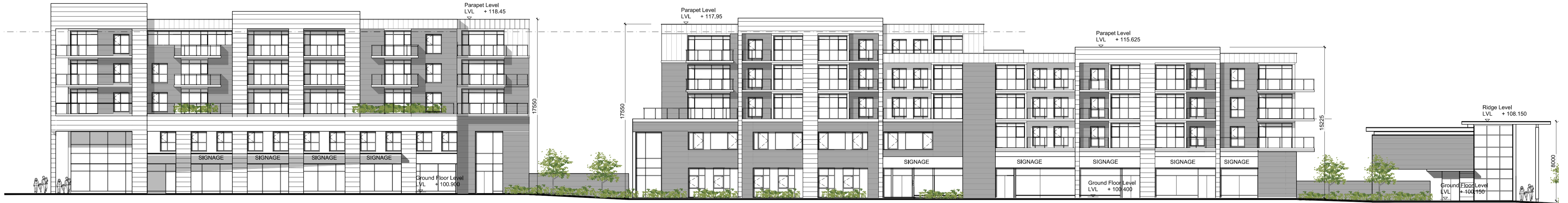
Cell 27 Creche & Retail Block C Apartments